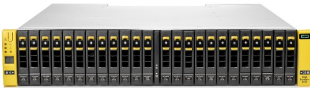
HPE 3PAR StoreServ 8000 Storage (2-Node Storage Base)

HPE 3PAR StoreServ 8000 is storage made effortless.