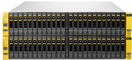
HPE 3PAR StoreServ 8000 Storage (4-Node Storage Base)