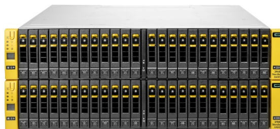
HPE 3PAR StoreServ 8000 SFF(2.5in) SAS Drive Enclosure